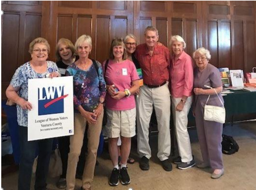
League members learn what it means to live in fear of deportation at "Good Allies" immigration forum.

had a much clearer appreciation for the stresses under which undocumented immigrants are currently living, fearing that at any minute they might be arrested. Tragically this stress often keeps them isolated and too afraid to participate in regular community life.